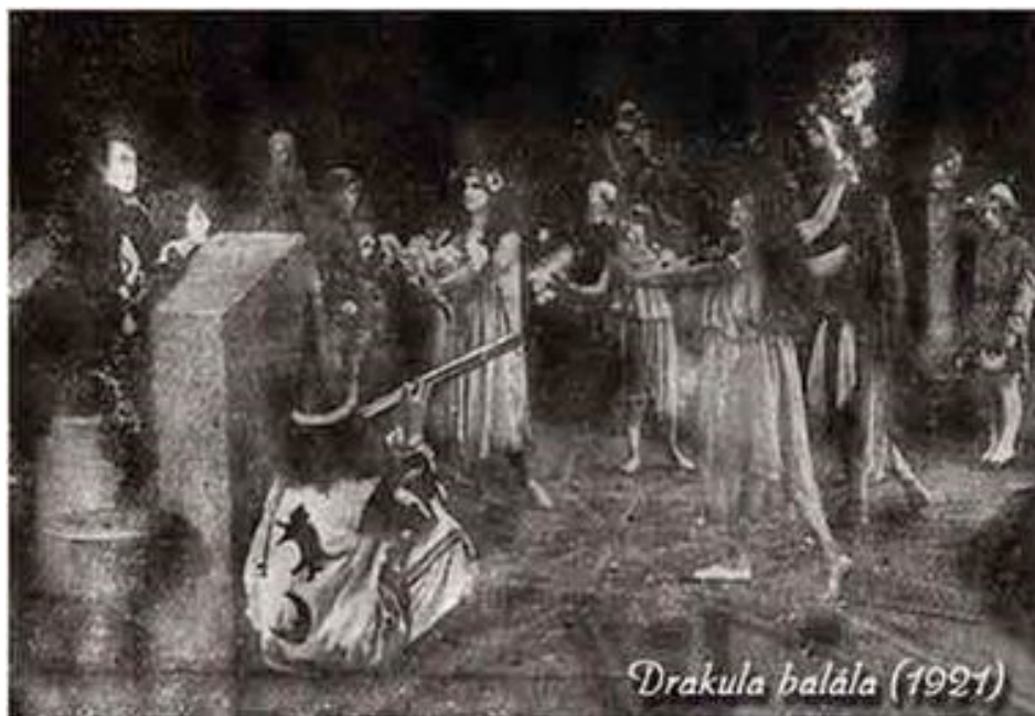
Originally published as a serial in 1914, the tale was released in novel form the following year. Included in the book's second edition were 18 illustrations created by Hugo Steiner-Prag. Albin Grau, Nosferatu's Art, Costume, Production says this and other images had a huge influence on Nosferatu's concept storyboards.